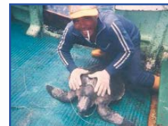
Take an active role to minimize the capture of turtles in longline fisheries.

Researchers are studying designs to place all baited hooks below a target depth to reduce capture of turtles and other undesired species. The technique is also being assessed for its ability to enhance catch-per-unit-of-effort of target species.