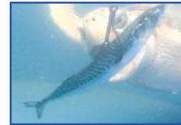
Using fish as bait instead of squid, when available, may help keep turtles off your hooks.