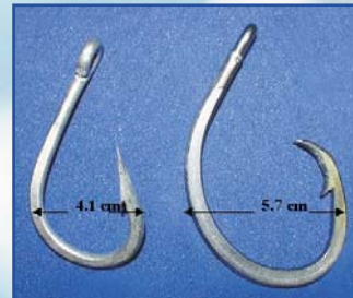
9/0 J hook (left) and 18/0 circle hook (right)