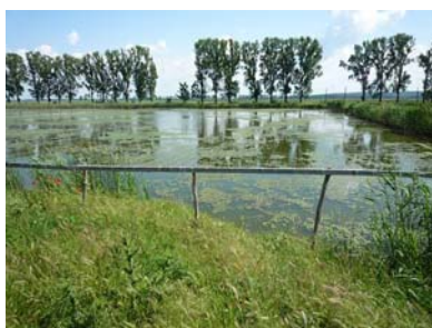
Potential model site in Romania for the Danube PES project