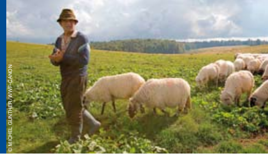
Shepherd, Gradistea Muncelului Cioclovina Nature Park, Romania